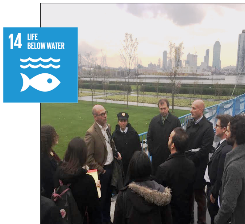
Planning for the UN's first Ocean's Conference UN Headquarters North Lawn