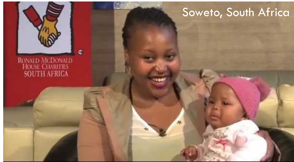
Soweto, South Africa